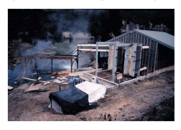
Figure 3. Hot water intake and plate heat exchangers.

The Prawn Farm pays a royalty to ECNZ for the heat source; however, the Prawn Farm is still the third largest annual electricity consumer in the Taupo District. The farm would not be economically viable if electricity were used for heating, instead of the waste hot water. The farm does pay water rights to use the Waikato River water, and this is reviewed on an annual basis.