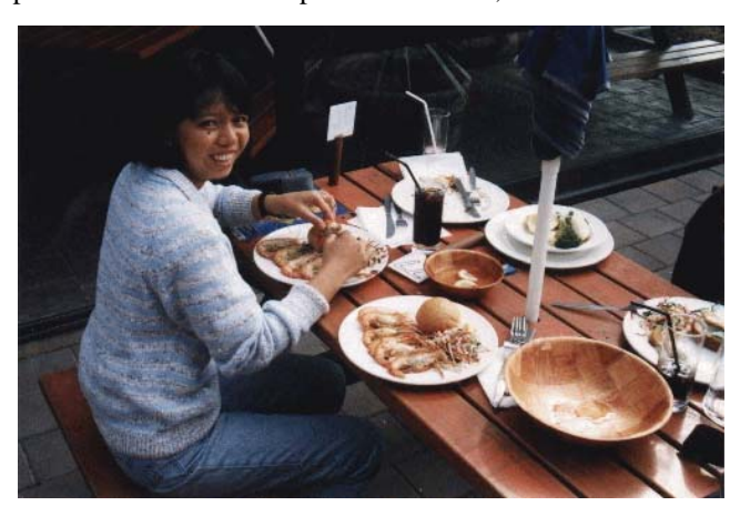
Figure 8. A satisfied customer.

Ninety percent of the harvested prawns are sold to the Bar and Grill next door, with the rest going to gourmet restaurants in Queenstown, Wellington and Whakatane. Over a recent three year period, the restaurant has served more than 30 tonnes (33 tons) of prawns to more than 45,000 visitors (Figure 8). This is 10 percent of the prawns consumed annually by Kiwis. The restaurant offers a plate of 16 prawns for NZ$ 22 (US$ 15) or a half plate of 8 prawns for NZ$ 12.50 (US$ 8). This past year, with a full-time marketing manager and half-hour hatchery tours operating five hours a day (at NZ$ 4 - US$ 2.7 per head), more than 25,000 tourists, 50 percent domestic and 50 percent overseas, have been attracted.