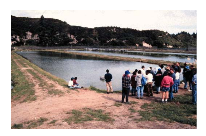
Figure 2. Detail of outdoor pond.

The present 19 ponds vary in size from 0.2 to 0.35 ha (0.5 to 0.9 acres) and have a depth of 1.0 to 1.2 m (3.3 to 3.9 ft), providing a slope for ease of harvest. The length to width ratio of the pond surface is approximately 20:1. The sides are sloped for stability and the bottom material is composed of an impermeable volcanic ash that also stores nutrients for the prawns (Figure 2).