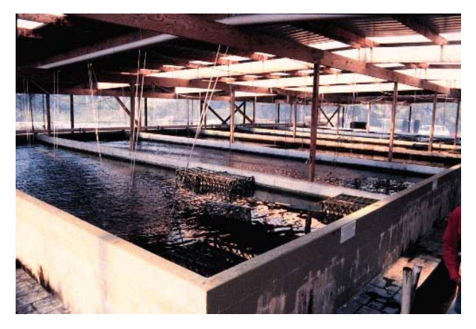
Figure 6. Nursery ponds.

After four months in the nursery, the prawns are transferred to the outdoor growout ponds for their final growth of a further five months. The prawns are moved manually using a net with mesh openings that catches only the larger ones.