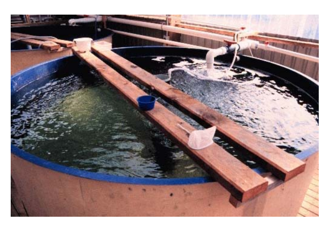
Figure 5. Larval tank.

After spawning, the larvae are attracted by light where they are siphoned off into a catching bucket and placed in the larval tanks. The larvae undergo eleven different moults to metamorphose into a post larvae in 30 days. They are fed three times a day with a mixture of crushed mussels and scrambled eggs (Figure 5).