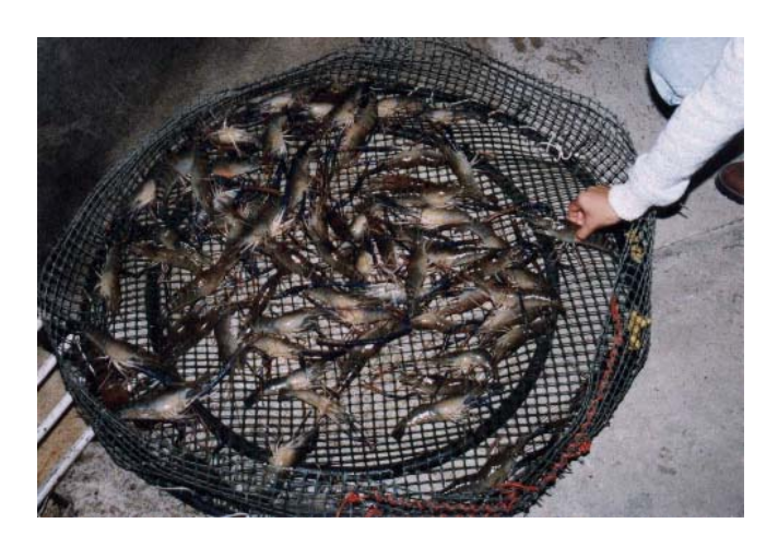
Figure 4. Harvest prawns.

Presently the farm is capable of producing up to 30 tonnes (33 tons) of prawns per annum of prawns (Figure 4). The life of the prawn starts in salt water inside in breeding tanks and end in the freshwater ponds outside where they are harvested after nine months averaging 30 to 40 per kg (14 to