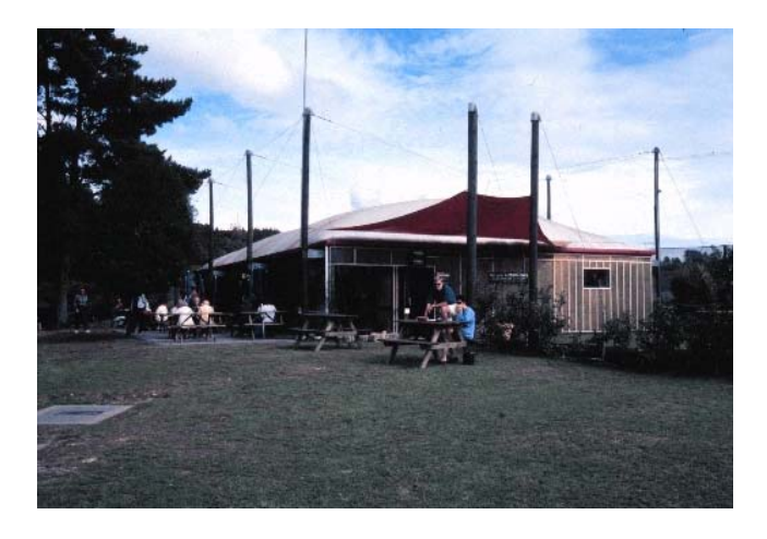
Figure 7. Bar and Grill restaurant.

At the end of the five months, the ponds are drained and the prawns picked up manually from the bottom by four to six harvesters. The prawns are then transferred to the hatchery for washing before they are taken fresh to the restaurant (Bar and Grill) or snap frozen for future use (Figure 7).