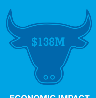
ECONOMIC IMPACT FOR THE WAIKATO ATTRIBUTED TO FIELDAYS