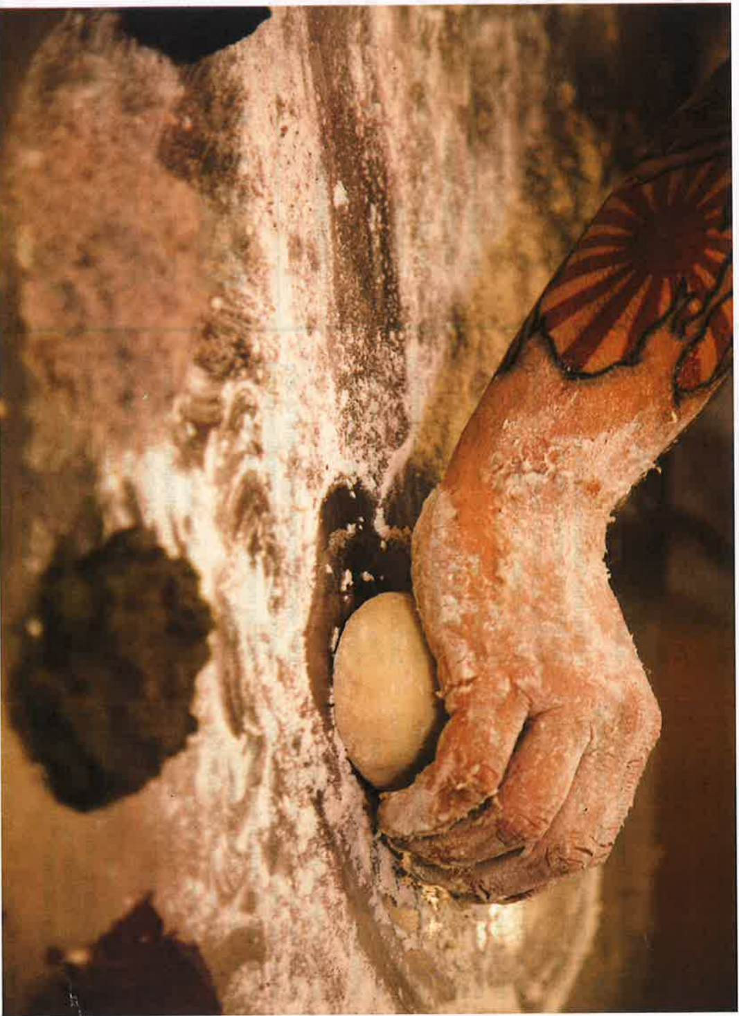
Hemp flour is not only gluten free but is also high in fibre, fatty acids, vitamins and minerals.