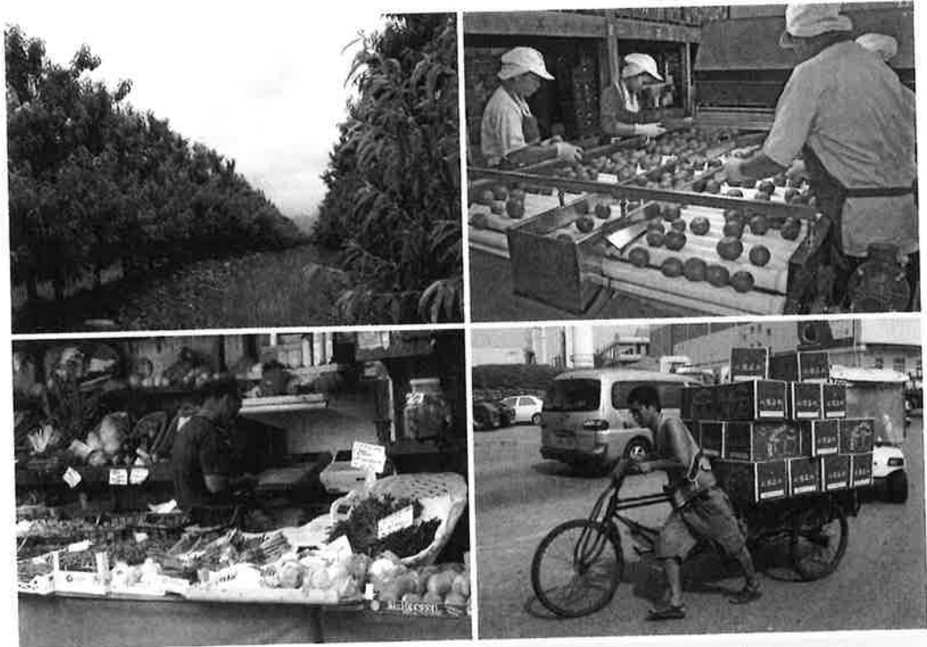
Production, processing and sales are each critical stages in the supply chain. Upper left: peaches, Cape Region, South Africa. Above right: citrus sorting, Thailand. Lower left: fresh fruit and vegetable retail, Venice, Italy. Lower right: transporting apples, Guangzhou, Guangdong Province, China.