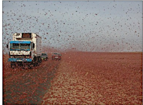
Desert locusts in Morocco